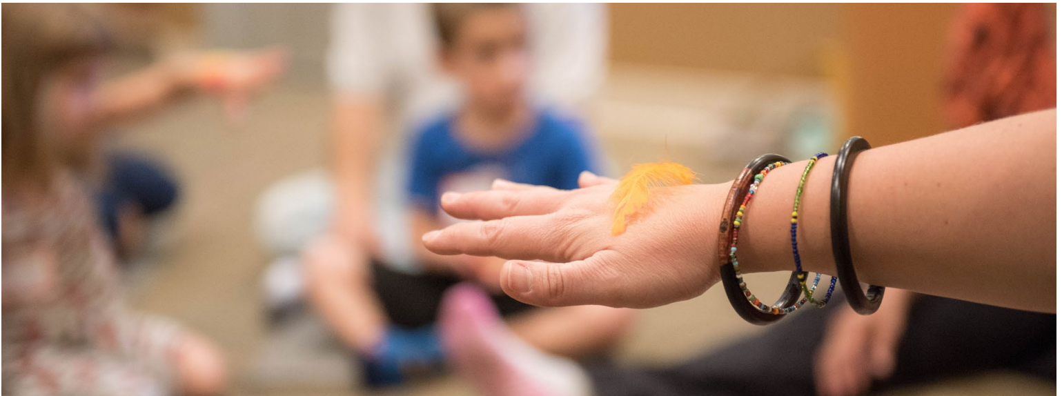
Using feathers, prekindergarten students respond to movement prompts and identify body parts, such as the top of the hand.