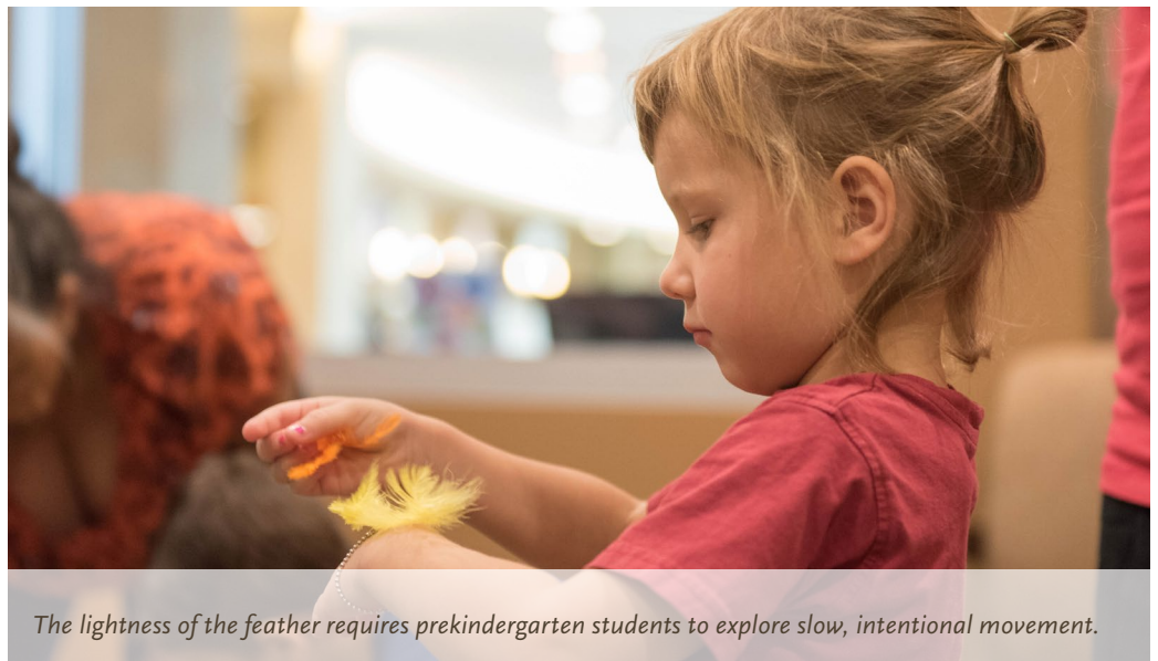
The lightness of the feather requires prekindergarten students to explore slow, intentional movement.