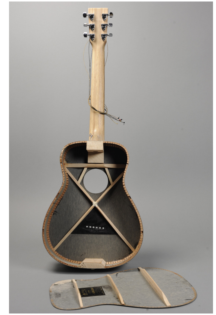
X-bracing improves the resonance of Martin acoustic guitars.

Arizona State University's Consortium for Innovation and Transformation in Music Education (CITME) Curates Numerous STEM/STEAM Music Education Resources