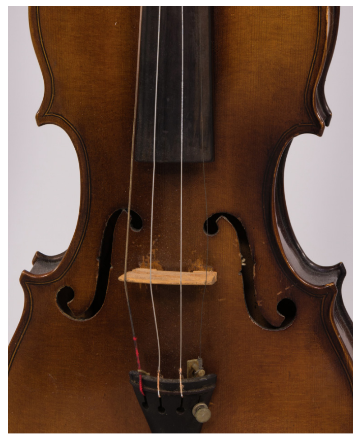
So-called f-holes on a violin improve its resonance at lower frequencies.

E. Does your instrument sound better if played at certain frequencies more than at others? Every material will have a "Helmholtz resonant frequency" at which it will amplify a specific frequency with the most efficiency. Herman von Helmholtz was the German scientist who first discovered how different materials could be used to amplify specific frequencies depending on their mass and density, among other things. Some materials resonate best at very low frequencies, and some resonate best at very high frequencies. This is called the "resonant frequency" of that material. Putting a material under tension (by stretching a drumhead or pulling a string tight) affects resonant frequency because it changes the physical properties of that material at a cellular level.