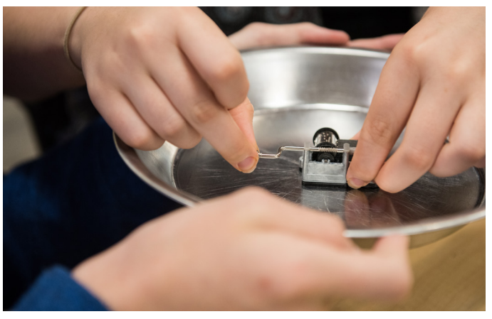
Students experiment with different resonating materials.