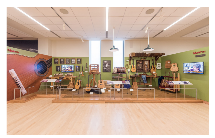
C. F. Martin & Co. is an innovator in acoustic guitar design.