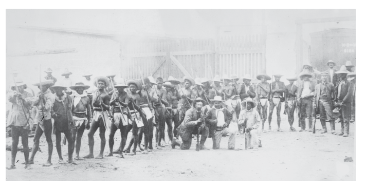
Figure 8. Early twentieth-century photograph of Yaqui Indians, c. 1910–1915.

* Extract from Edward H. Spicer, "Excerpts from the 'Preliminary Report on Potam'," Journal of the Southwest 34, no. 1 (1992): 127–128. Extract edited for clarity by MIM Education.