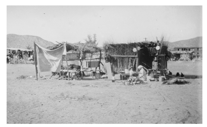
Figure 7. Yaqui Indian Camp, Ortiz, California, c. 1910– 1915.