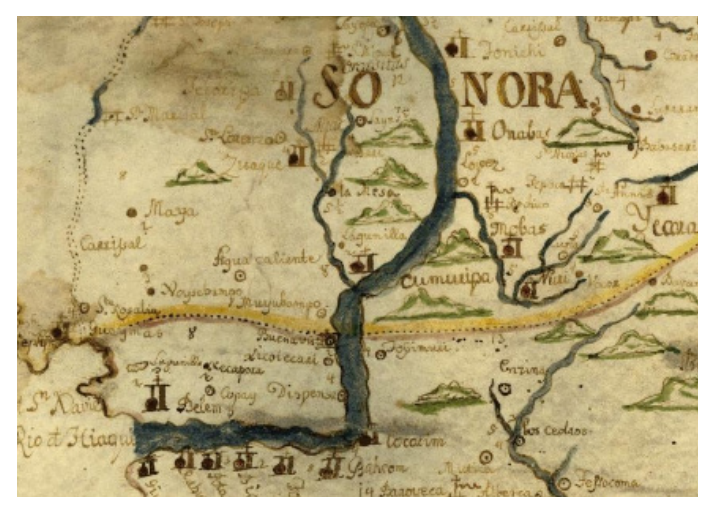
Figure 9. Eighteenth-century map of Jesuit Missions in Sonora, Mexico.

There were still a number of rebels and troublesome persons, particularly the sorcerers, who were ministers of Satan and enemies of Christ and his evangelical law. However, God had willed that the time had finally